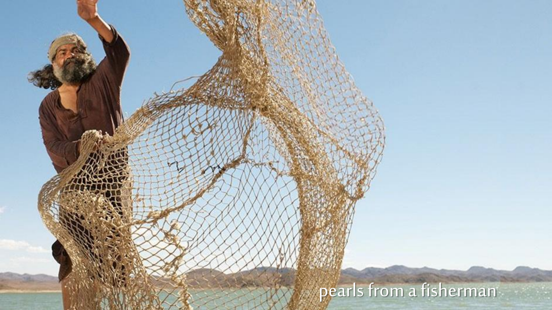
pearls from a fisherman