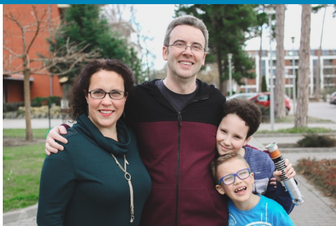
The Lucas Family